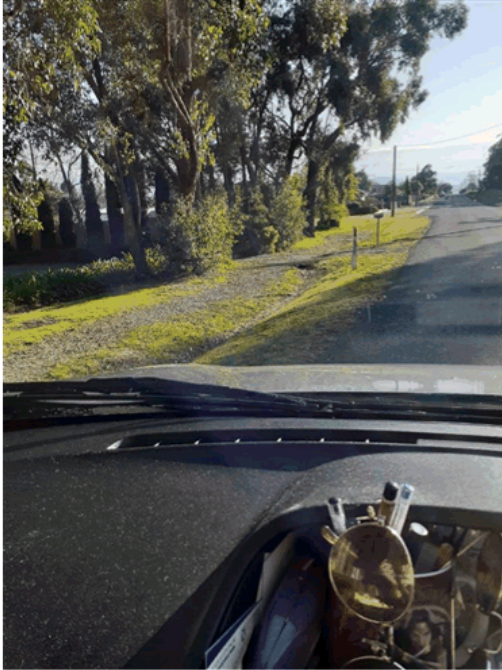
Current dirt and gravel footpath along Wirraway Street Extension to bus stop.