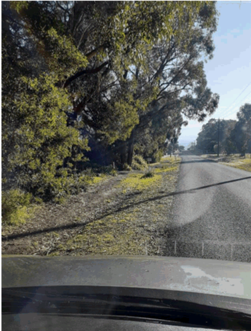
Uneven pathway with declines that fill with water causing deep mud holes.