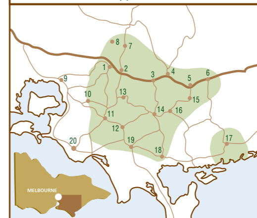
Known Range of E. strzeleckii in West & South Gippsland

The number of Strzelecki Gums still remaining is difficult to quantify, largely due to it having been confused with Eucalyptus ovata var. ovata (Swamp Gum).