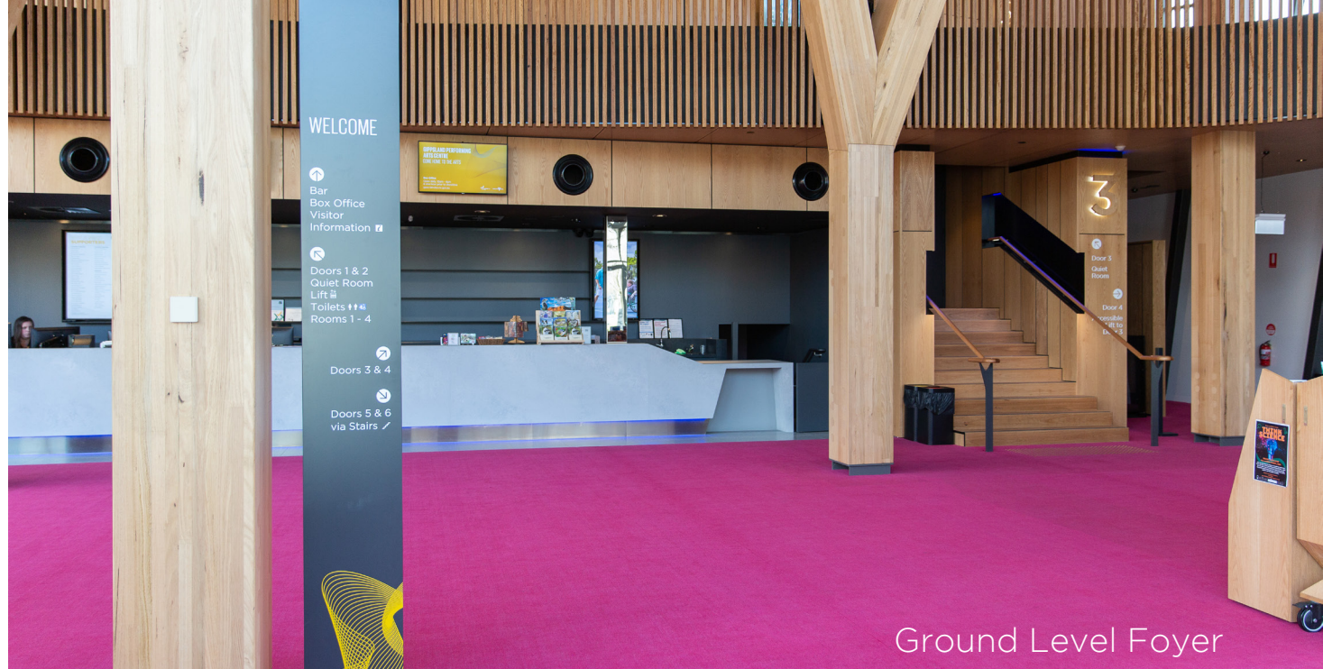
Ground Level Foyer

Foyers are where people wait before a show starts.