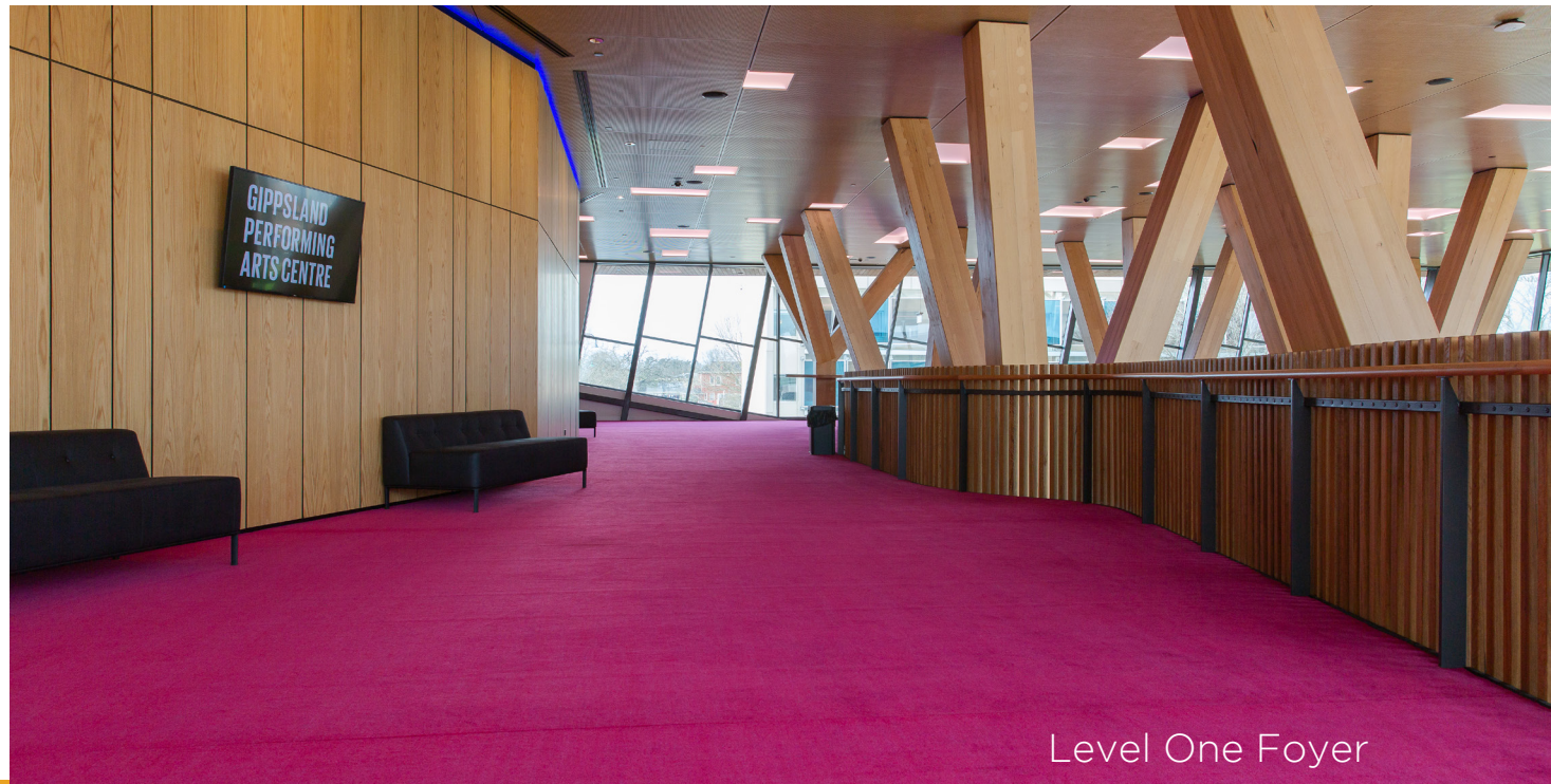
Level One Foyer