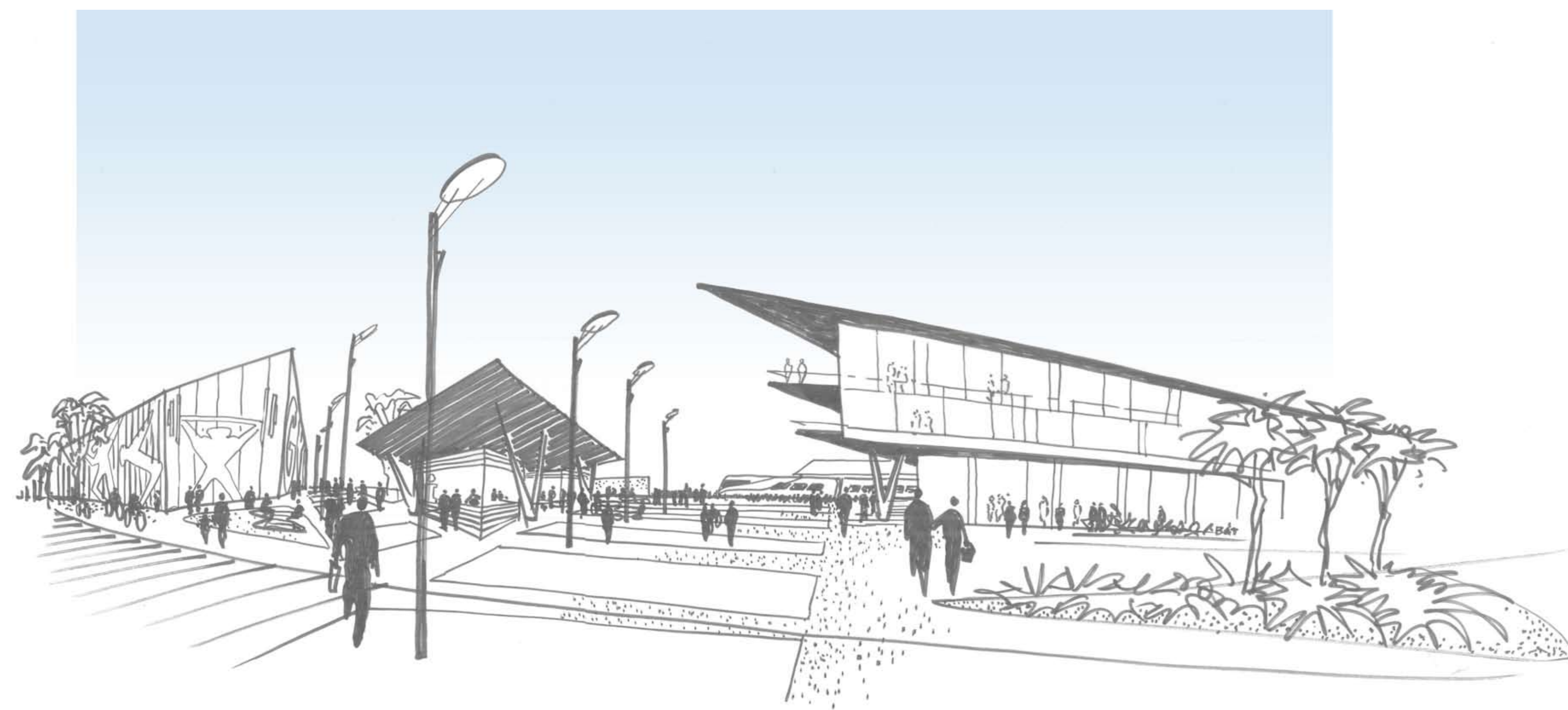
Indicative view from Moore Street towards Civic Hub, City Square and Station

The Moe Activity Centre Plan has been identified by Latrobe City Council and the State Government as a regional project of strategic significance with the potential to reinvigorate the Moe town centre, establishing it as a vibrant, dynamic and welcoming centre through implementation of the projects contained within the plan. A Master Plan for the Moe Rail Precinct Revitalisation Project has now been developed using the information obtained from the extensive community consultation that was undertaken during May 2009 and October 2009.