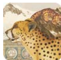
Image credit: Meg Viney, Sipapu , 2011, orchard prunings and paper. Collection of Karen Murphy.

Creating sculptures from natural resources, Viney builds delicate containers with fibre, bark, twigs and obsessive stitching.